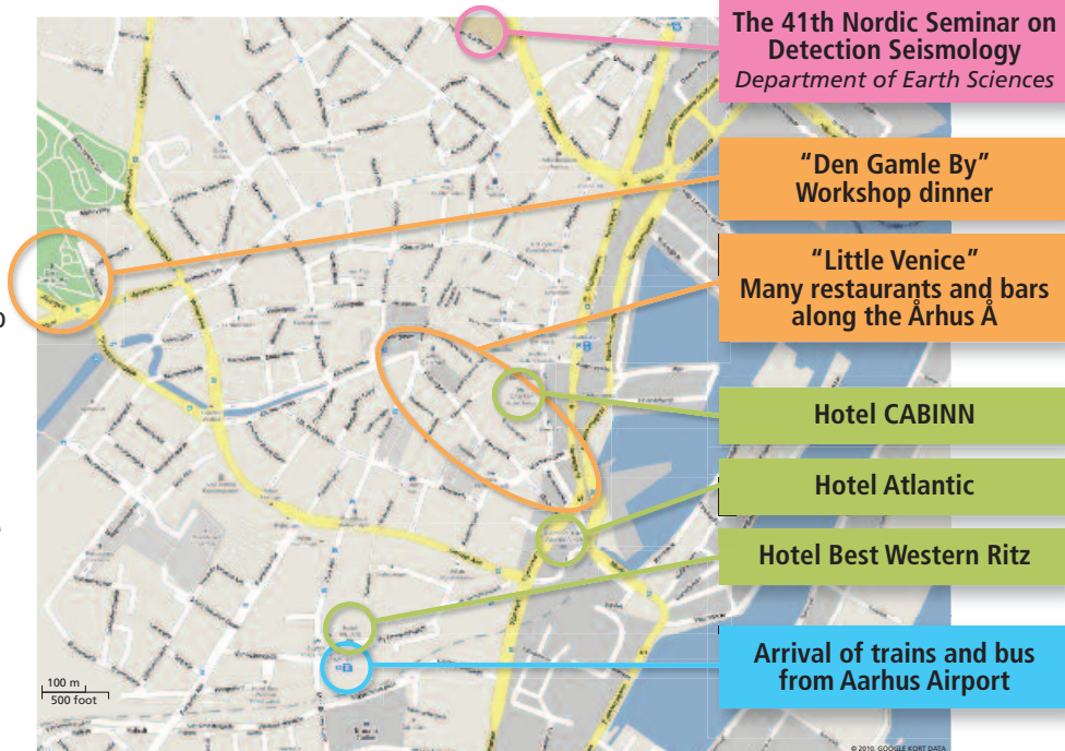
A larger version of this map can be found at the last page of this folder.

Monday September 20, 12:00. This is the deadline for abstract submission, payment of registration fee, and submission of data for the earthquake concert (see below). Please also let us know at this time if you expect to participate in the conference dinner Thursday evening. The pre-reservation of hotel rooms at a special price expires on September 21.